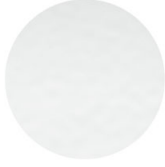
RAL 9016 VR Traffic white ☀