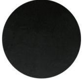
RAL 9005 VR Matt Jet Black ☀