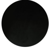
RAL 9005 VR Jet black ☀