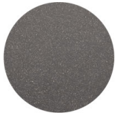
VR Pewter ☀