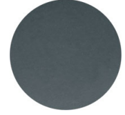
RAL 7016 VR Anthracite grey ☀