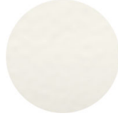
RAL 9010 VR Pure white ☀