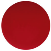
RAL 3003 VR Ruby red ☀