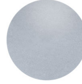
RAL 9006 VR White aluminium ☀