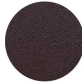
VR Rough metallic bronze ☀