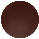
RAL 8017 VR Chocolate brown ☀