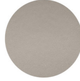
PANTONE 402 C VR Turtle-dove ☀