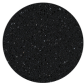
Tebas Black 1856