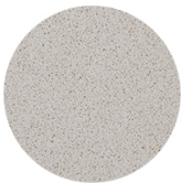
White Storm 1855