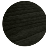
Black stained ash wood