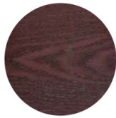
Ash | Dark brown stained