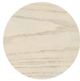
Ash | Grey stained