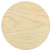
Ash | Honey stained