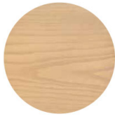
Ash | Chesnut stained