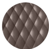
NCS S6502-R Argilla