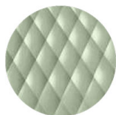
NCS S3010-G50Y Pistacchio