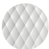
NCS S0502-B Bianco traffico