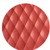
NCS S3060-Y80R Rosso Corallo