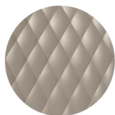
NCS S4005-Y50R Tortora