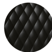
RAL 9005 Nero intenso