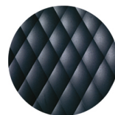
NCS S7502-B Grigio antracite