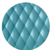
NCS S4020-B10G Blu polvere